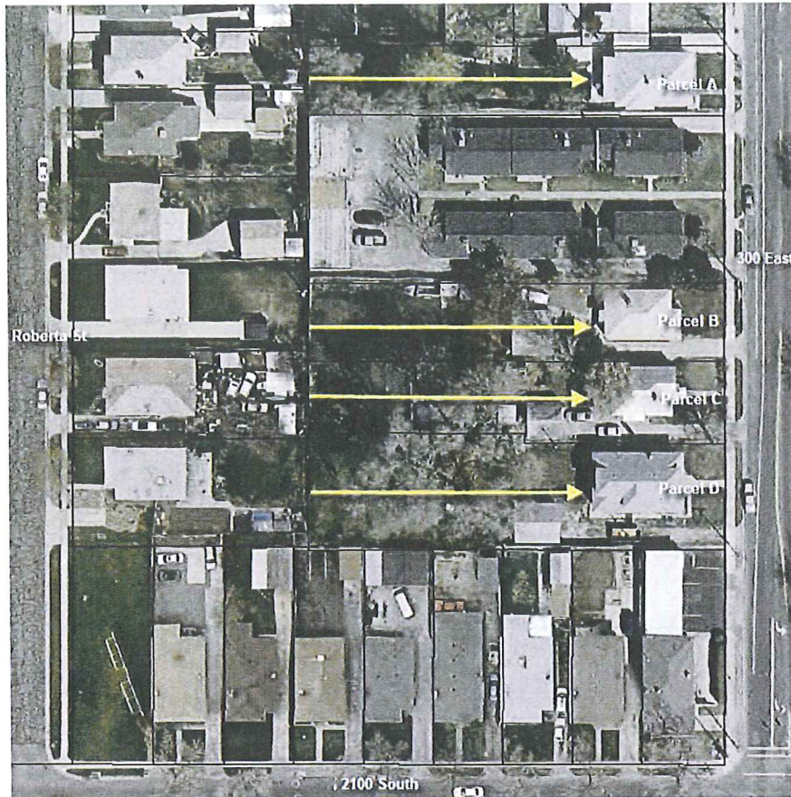
Liberty Wells Example 2006 South 300 East, 2016 – 2030 South 300 East Parcel A: the rear lot line is 163 feet from the rear of the dwelling. Parcel B: the rear lot line is 163 feet from the rear of the dwelling. Parcel C: the rear lot line is 161 feet from the rear of the dwelling. Parcel D: the rear lot line is 158 feet from the rear of the dwelling.

The aerial photographs above are examples of the potential problems that are created by requiring a 5 foot maximum rear setback for accessory buildings. The majority of the shown parcels of property are large and deep. Any accessory structure constructed on these lots would have to be over 100 feet in most cases or near 100 feet in others from the rear of the primary dwelling. This would require a lengthy driveway that covers a large amount of the rear yard with hard surfacing. It is also evident that in the majority of the lots in the shown examples have demonstrated that it is a pattern in the neighborhood design to have accessory structures nearer to the home. This helps to ease the burden of maintenance and provides easier access to residents but also gives them more opportunities to fully utilize their rear yards.